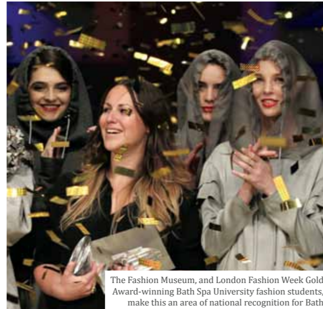
The Fashion Museum, and London Fashion Week Gold Award-winning Bath Spa University fashion students, make this an area of national recognition for Bath

✦ Work differently, smarter, cross-sector, public and private: raise our ambitions through a shared commitment to excellence for all and the creation of a city ready for future challenges and opportunities.