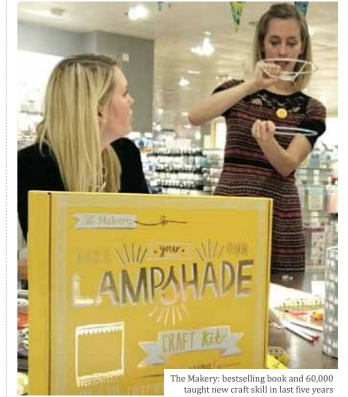
The Makery: bestselling book and 60,000 taught new craft skill in last five years

Self-initiated and self-governing groups are often defined by area of interest or through a specific project. This strategy review, through the CCBP, will encourage networking and collaboration across these groups and with individual enterprises.