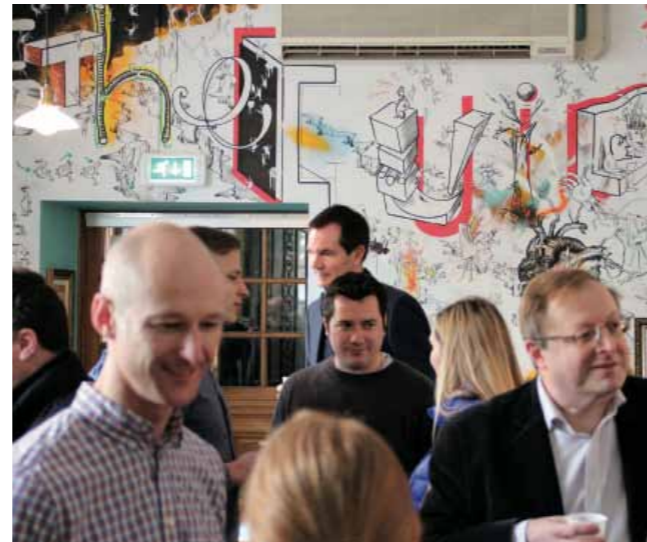
The Guild Co-working Hub: creative-tech workspace in central Bath

Research also demonstrates that taking part in arts activities has a positive impact on dementia and depression, and improves the likelihood of students from low-income families getting a university degree. The intrinsic value of culture and creative learning is at the heart of B&NES’ Child Friendly City initiative.