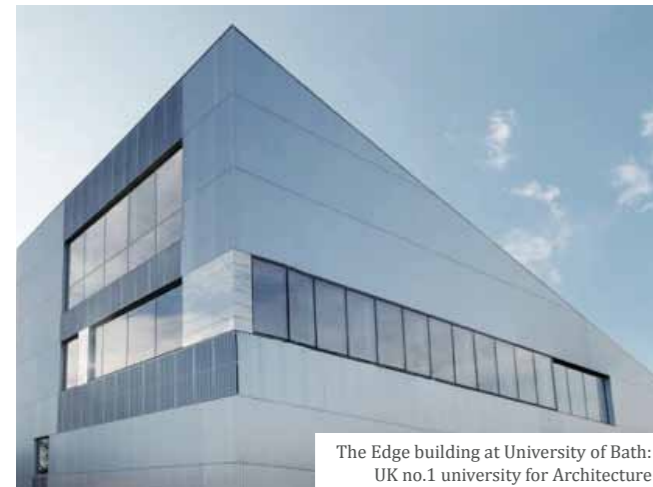
The Edge building at University of Bath: UK no.1 university for Architecture

✦ Increase availability and diversity of workspace hubs for creative and cultural industries along the lines of Bath Guild Co-working Hub, Bath Artists Studio, The Makery, and Glove Factory, also for satellite hubs in neighbouring market towns.